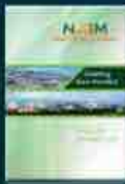
Annual Report 2013 NAIM HOLDINGS BERHAD