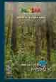
Annual Report 2022 NAIM HOLDINGS BERHAD