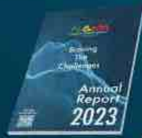
Annual Report 2023 NAIM HOLDINGS BERHAD