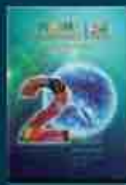
Annual Report 2015 NAIM HOLDINGS BERHAD