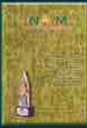
Annual Report 2008 NAIM HOLDINGS BERHAD Creating Value, A Step Forward