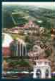
Annual Report 1999 NAIM CENDERA SDN BHD