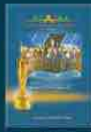
Annual Report 2004 NAIM CENDERA HOLDINGS BERHAD