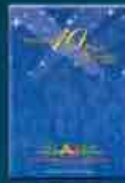
Annual Report 2005 NAIM CENDERA HOLDINGS BERHAD