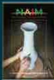
Annual Report 2003 NAIM CENDERA HOLDINGS BERHAD