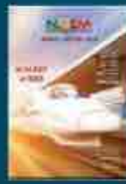
Annual Report 2018 NAIM HOLDINGS BERHAD