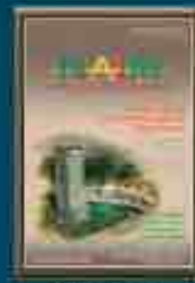
Annual Report 2006 NAIM CENDERA HOLDINGS BERHAD