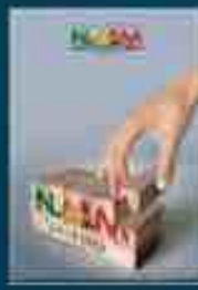
Annual Report 2016 NAIM HOLDINGS BERHAD