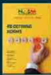
Annual Report 2020 NAIM HOLDINGS BERHAD