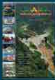
Annual Report 2010 NAIM HOLDINGS BERHAD