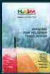
Annual Report 2019 NAIM HOLDINGS BERHAD