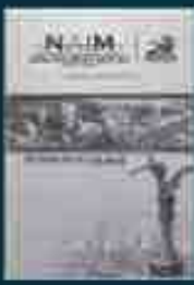
Annual Report 2014 NAIM HOLDINGS BERHAD