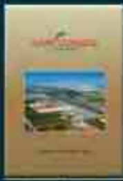
Annual Report 1998 NAIM CENDERA SOKSI Sdn Bhd