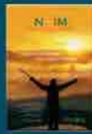
Annual Report 2012 NAIM HOLDINGS BERHAD