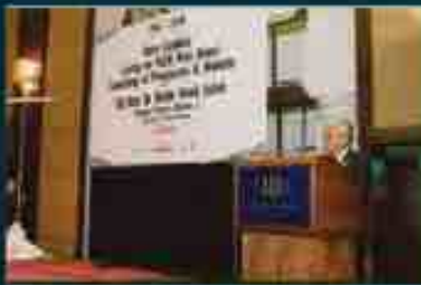
Listing on KLSE Main Board 2003