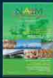
Annual Report 2007 NAIM CENDERA HOLDINGS BERHAD