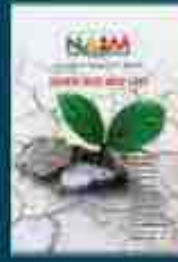
Annual Report 2017 NAIM HOLDINGS BERHAD