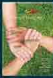
Annual Report 2021 NAIM HOLDINGS BERHAD