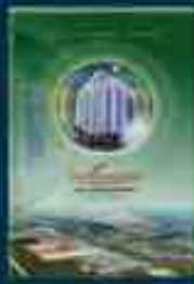
Annual Report 2000 NAIM CENDERA SDN BHD