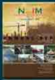
Annual Report 2009 NAIM HOLDINGS BERHAD