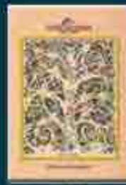
Annual Report 2002 NAIM CENDERA SDN BHD