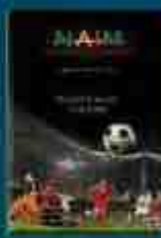
Annual Report 2011 NAIM HOLDINGS BERHAD